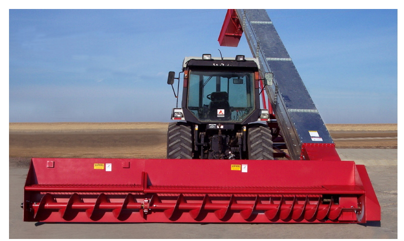
Tractor requirements: The distance from the 3-point hitch pins to the leading edge of the front tires can be up to 216" (18 ft.) maximum. The distance from the center of the PTO shaft to the end of the outside axle can be up to 60" maximum.

Loads a typical grain trailer from your flat storage pile in as little as 3 minutes. Fits most tractors. Recommended mounting on 150 HP tractors and up. The Ultra Scoop from Sudenga features a 16' long by 16" diameter horizontal pick up auger with a 6' detachable wing. The 40' inclined chain conveyor has abrasion resistant liners and heavy duty chain to ensure long life and wear characteristics. The three-wheel transport provides an exceptionally low transport height.