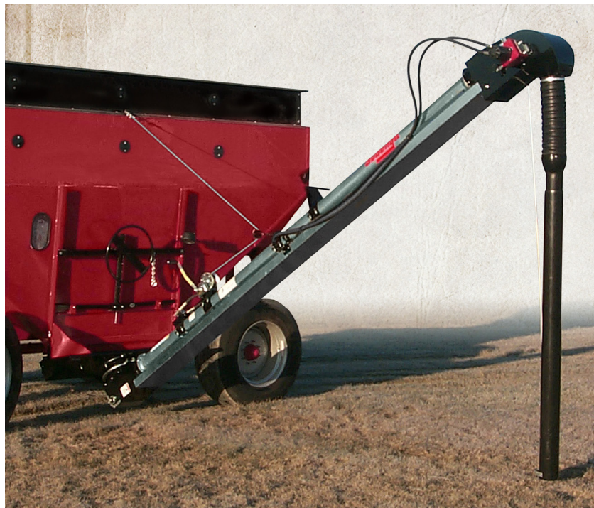
Shown with optional 3-piece telescoping spout