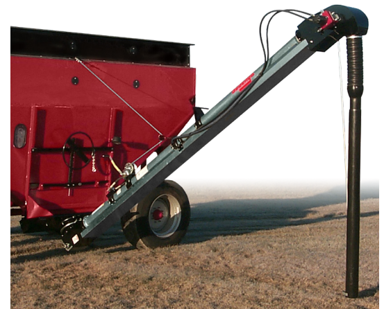
Shown with optional 3-piece telescoping spout