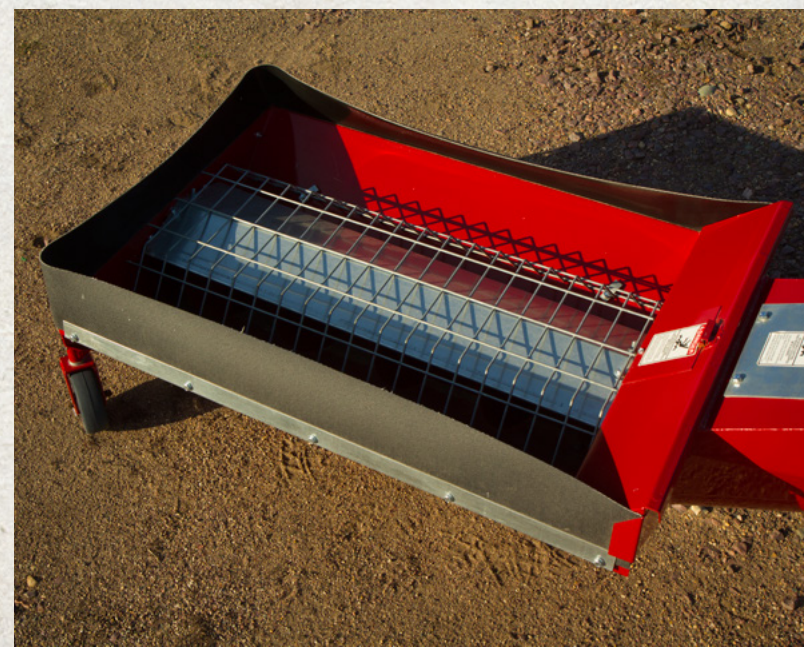
WIDE HOPPER WITH FLEX SKIRT