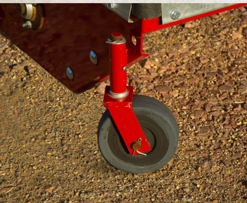
OPTIONAL SWIVEL END WHEELS