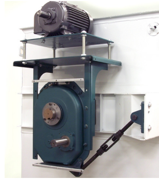
Torque arm reducer drive for M4000 and M6000 mixers. Belt guard is removed for illustration purposes.