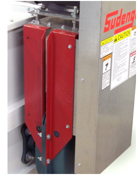
Screw conveyor drive for M1000 and M2000 mixers