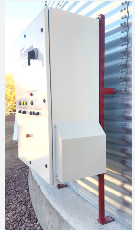
Simple installation. Site electrician just has to take panel, give it incoming power and connect it to the motor.

NOTE: Mounting feet included. More bracketry may be needed.