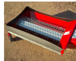
Wide hopper with flex skirt