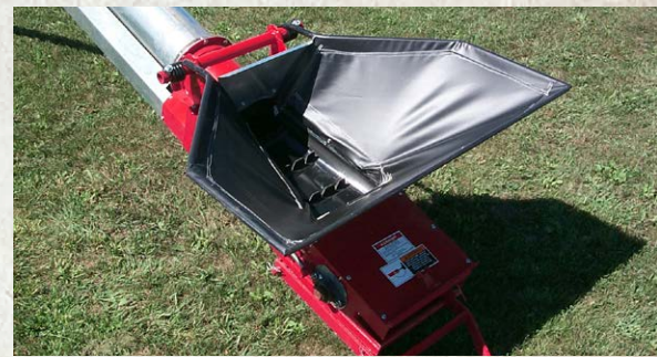
OPTIONAL COLLAPSIBLE INTAKE