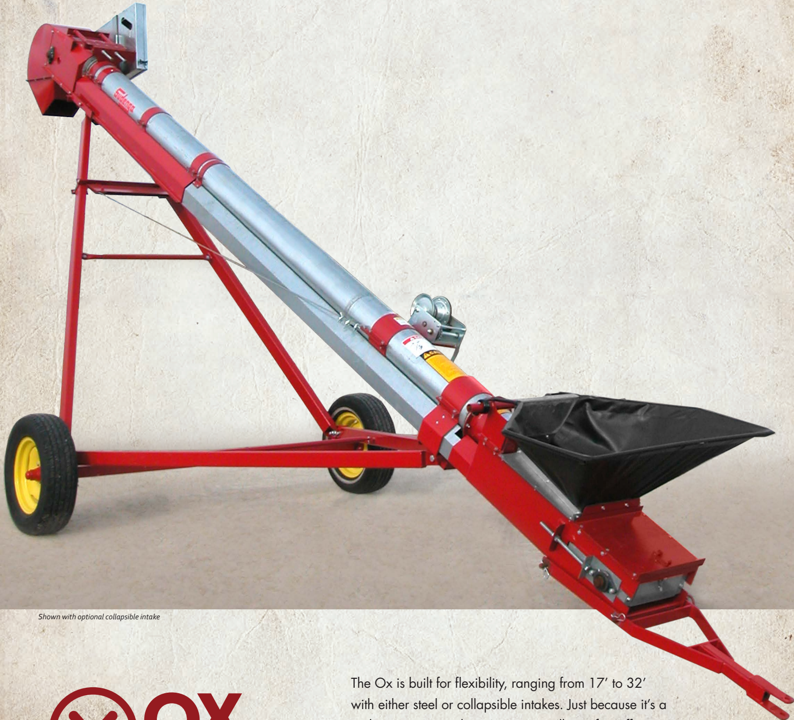
Shown with optional collapsible intake

THE 8" OX SEED BELT CONVEYOR IS ALREADY ONE STEP AHEAD OF YOU.