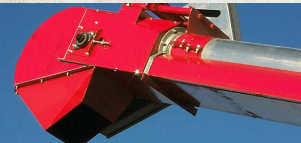
GENTLE TRANSITION SPOUT