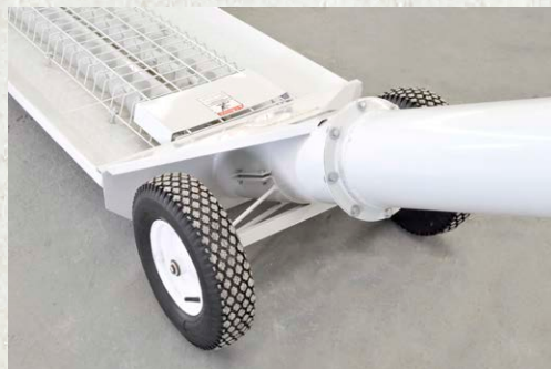
WELL BALANCED DESIGN FOR EASY MANEUVERING

The combination of twin lower augers and an enlarged intake, allows more fertilizer to enter the inclined tube giving this railcar unloading hopper it high unload rate.