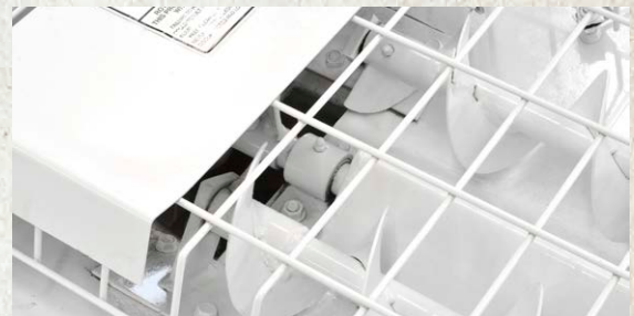
TWIN 4" HOPPER AUGERS

The combination of twin lower augers and an enlarged intake, allows more fertilizer to enter the inclined tube giving this railcar unloading hopper it high unload rate.